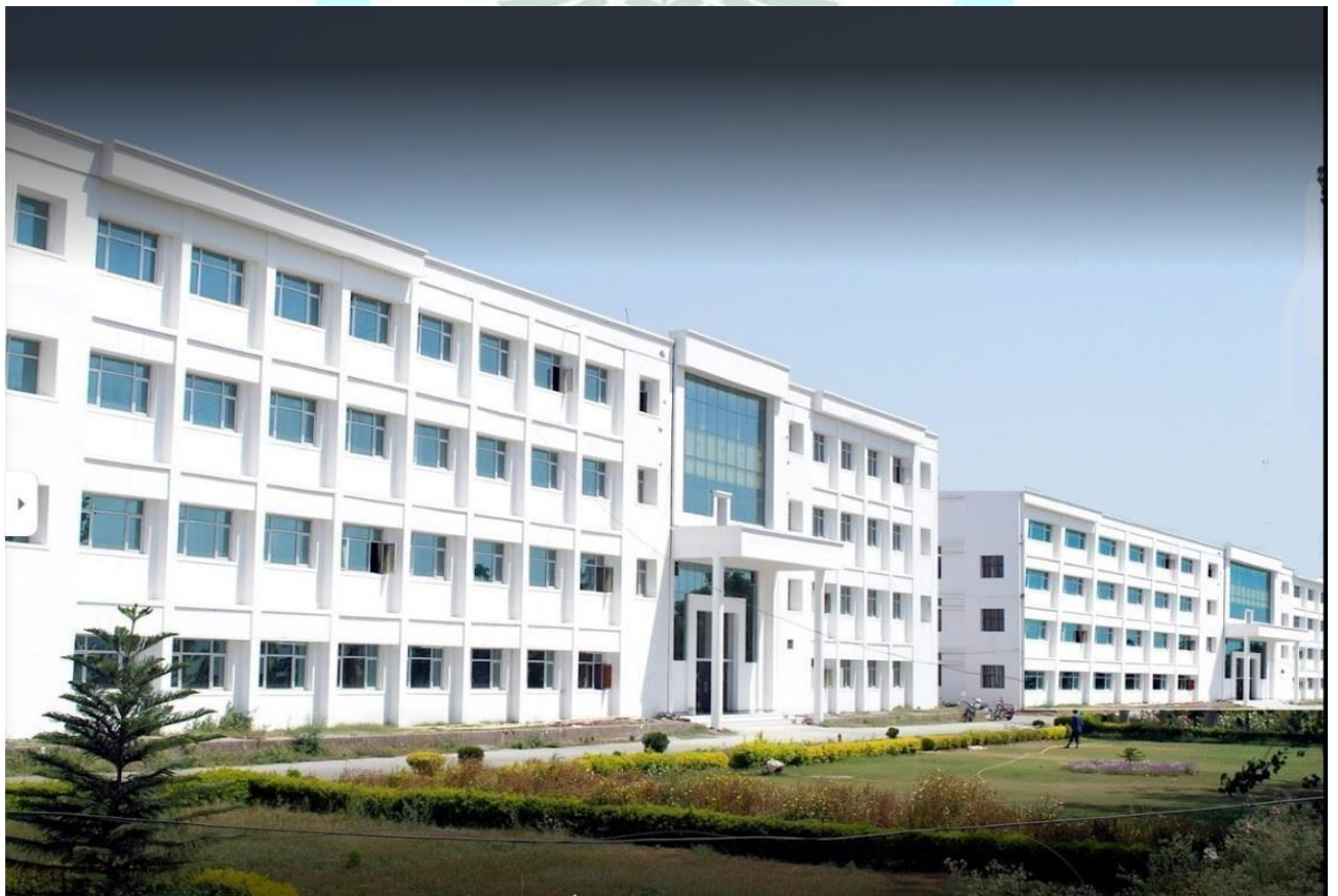
Himachal Institute of Dental Sciences, Paonta Sahib, Himachal Pradesh