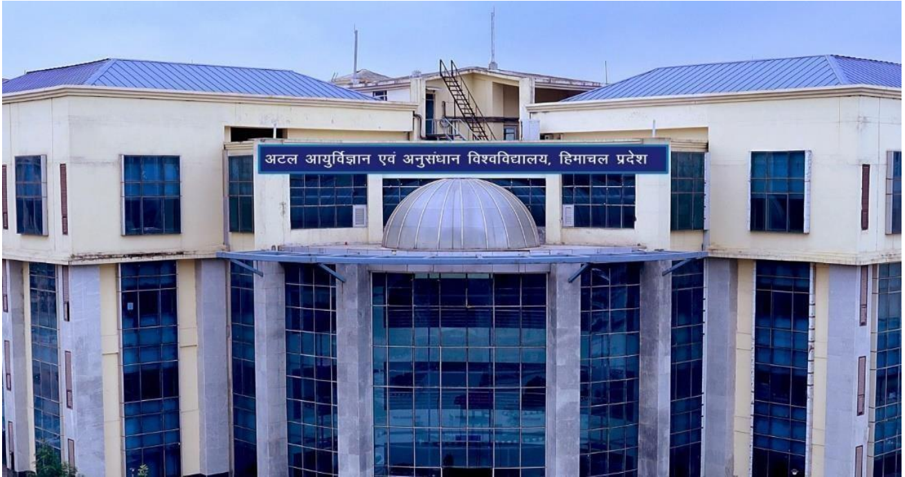
A VIEW Atal Medical and Research University, HP at Ner Chowk, Distt. Mandi