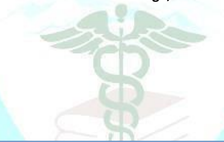
A VIEW Indra Gandhi Medical College, Shimla