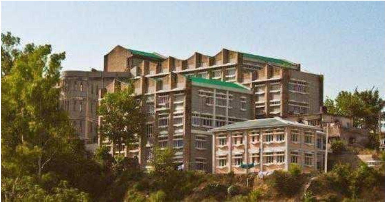
Dr. Radha Krishnan Govt. Medical College, Hamirpur