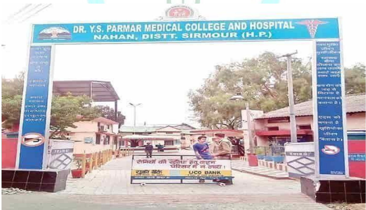
Dr. Y. P. Parmar Govt. Medical College, Nahan