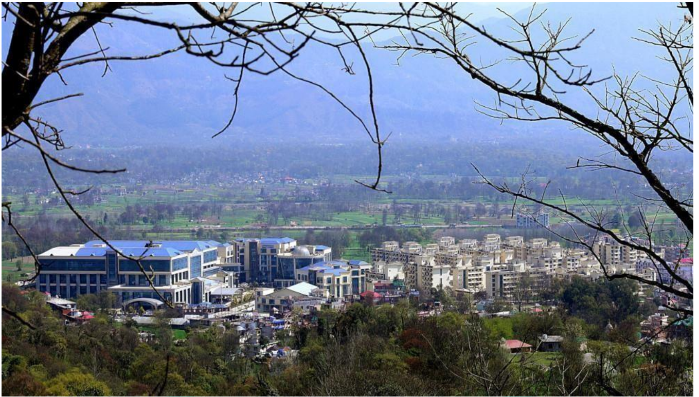
A View of Shri Lal Bahadur Govt. Medical College & Hospital, Nerchowk, Distt. Mandi (HP)