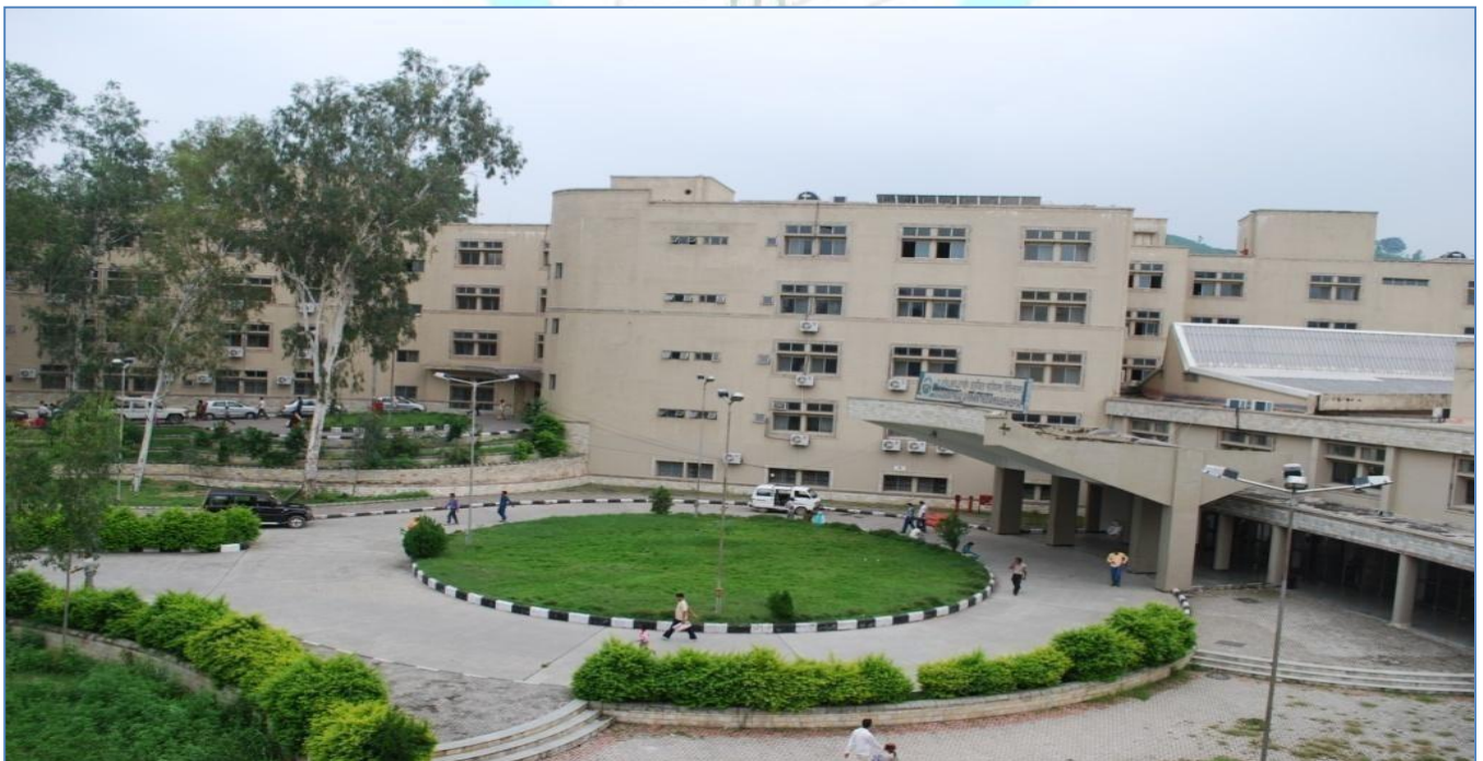
A VIEW OF Dr. R.P.G.M.C, TANDA AT KANGRA (H.P.)